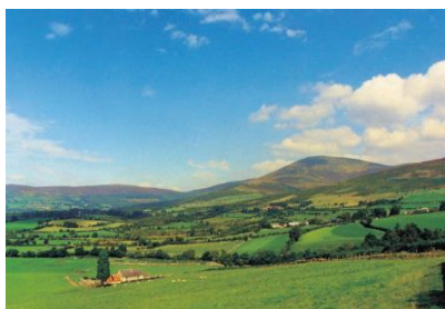
Backstairs Mountains & Mount Leinster

Carlow town is situated in a hinterland of beautiful villages. It is part of Ireland's Ancient East, with waterways, mountain trails, monastic sites, country estates dotted throughout the County. Carlow town is a hub for shopping with many independent fashion boutiques, along with national and international shops. Carlow town boast a superb range of eateries, bars, cinema and nightlife. Carlow town and County have varied activities throughout the year with many festivals celebration the areas arts and culture.