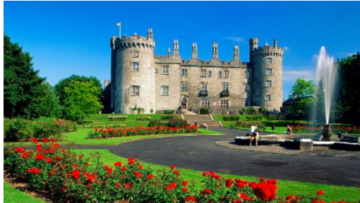
Rose Garden, Kilkenny Castle

Kilkenny, the Medieval Capital of Ireland is located 90 minutes from Dublin, two hours from Cork on the banks of the beautiful River Nore, which sweeps quietly through the city centre and county. Kilkenny city can be access by the M9 Dublin to Waterford Motorway, by bus and/or by rail at McDonagh Station. Kilkenny is also a landlocked county bordered by Laois, Carlow, Wexford, Waterford and Tipperary with a population of 26,512 (2016 census).