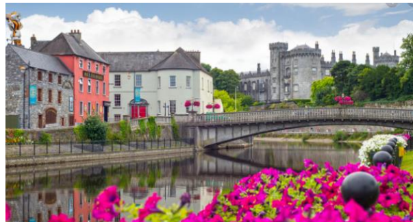
John's Bridge Kilkenny

Sport is always at the centre of Kilkenny living from Hurling, Camogie, Handball and other Gaelic Games played throughout the City and County, to Horse Riding, Canoeing, Cycling, Golfing to name but a few..... Kilkenny is also renowned for its festivals from the Cats Laugh in June, Arts Festival in August, and Food festival in October, there is always something to do.